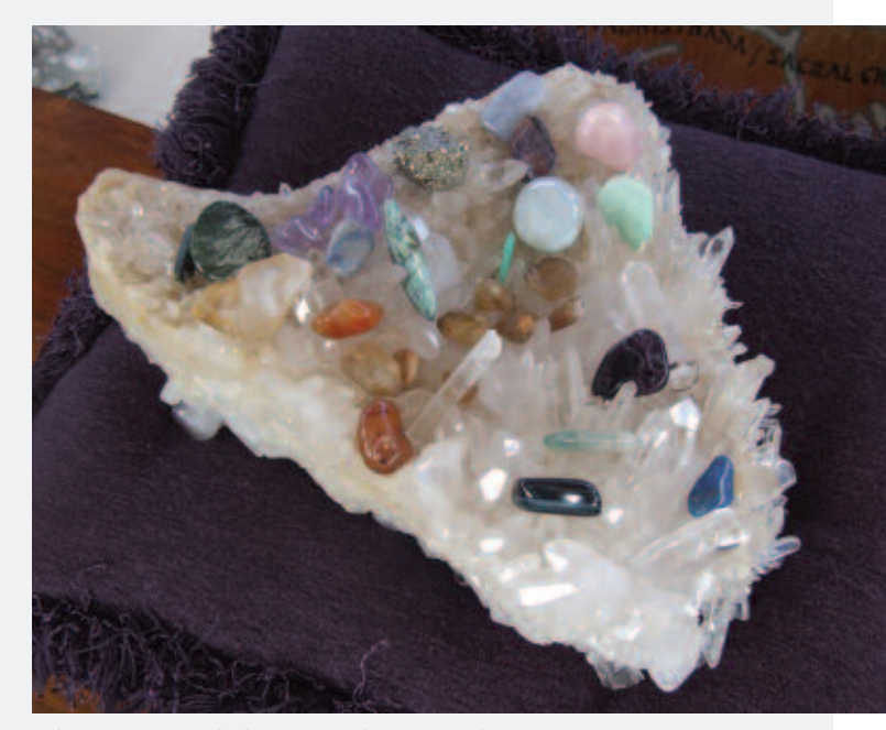
Cleansing and charging the crystals.

Next, pray for Reiki to flow through you and into the crystals, intending to charge them with Reiki and asking them to serve as instruments for healing for the highest good. Invite the spirit or guardian of the stone to assist in the healing. You may also use the Japanese Reiki breath technique, koki-ho to program your crystals for healing.